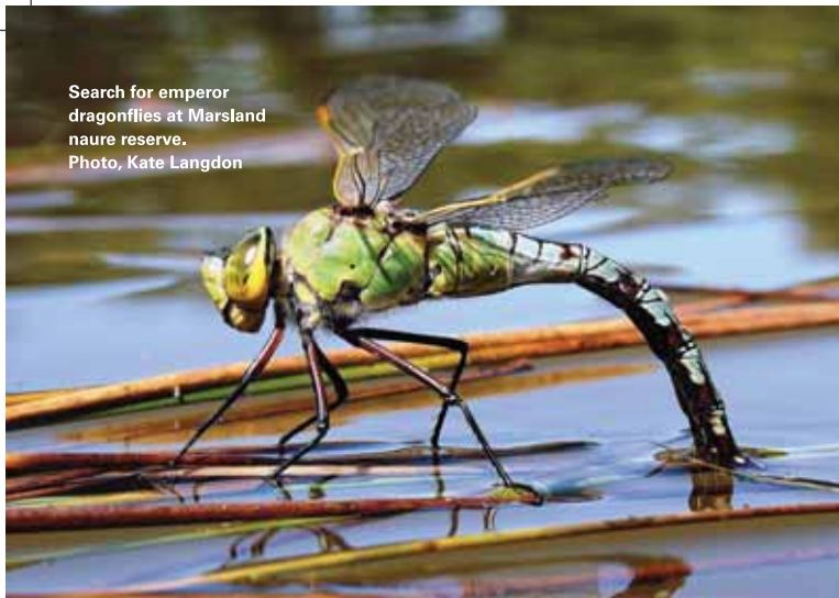
Search for emperor dragonflies at Marsland nature reserve.